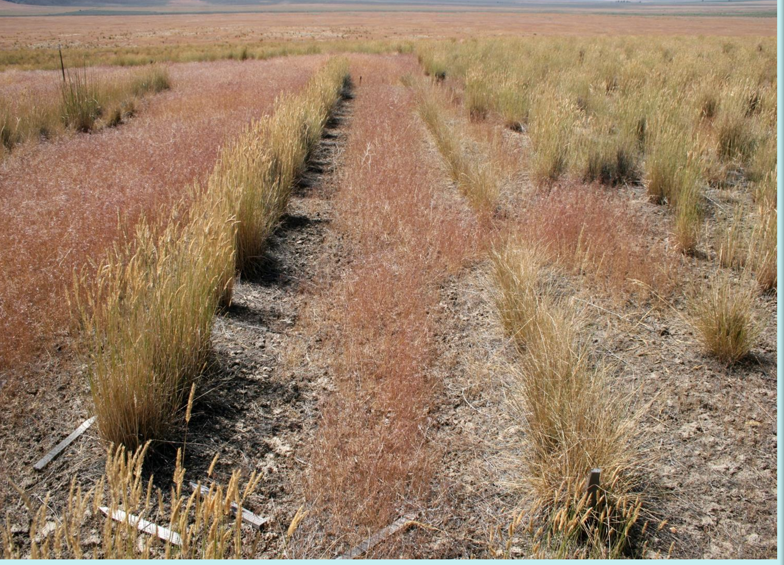
Figure 3. Notice the cheatgrass suppression along these perennial grass rows.

Cheatgrass densities in June 2010 in the 'Hycrest' and 'Sherman' plots averaged 7.3/m<sup>2</sup> (2.2/ft<sup>2</sup>) and 10.2/m<sup>2</sup> (3.1/ft<sup>2</sup>) (Fig. 3) compared to 817.4/m<sup>2</sup> (247.7/ft<sup>2</sup>) in the control, 204/m<sup>2</sup> (62/ft) in the bluebunch wheatgrass and 301.62/m<sup>2</sup> (91.4/ft<sup>2</sup>) in the squirreltail ( Elymus elymoides ) plots.