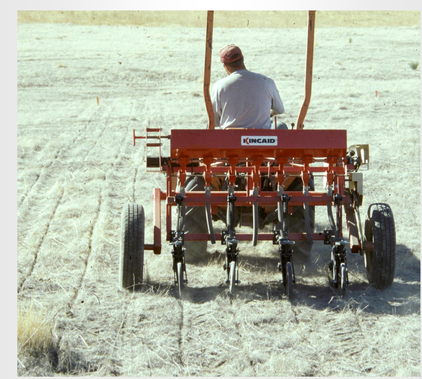
Figure 2. Seeding specific species using the kincaid no-till drill on herbicidal fallowed plot.

This research was conducted at Antelope Creek, near Orovada, Nevada at an elevation of 15,180 m (4,600') (Fig. 1). The site had repeatedly burned since the big firestorm of 1939. The soils are a silty loam in a 20-25 cm (8-10") precipitation zone. In the fall of 1999, Sulfometuron Methyl, trade name 'Oust', was applied at .10 g/ha (1 oz/ac) rate to the study site and fallowed for one year.